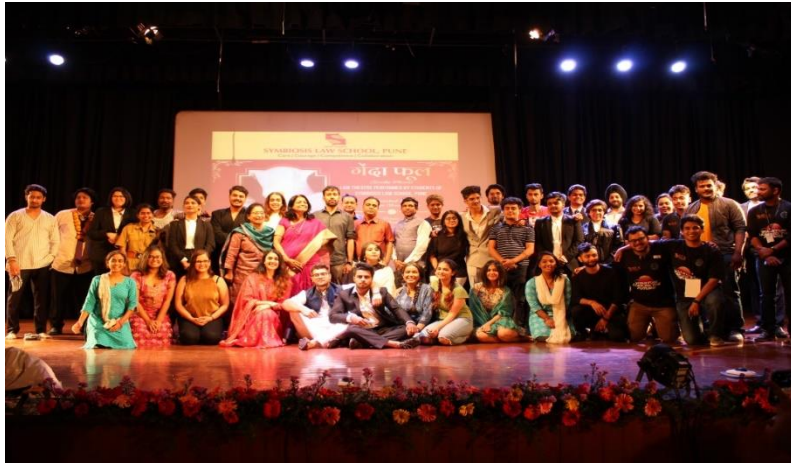
(Law Theatre based on Marital Rape: ‘Genda Phool’)