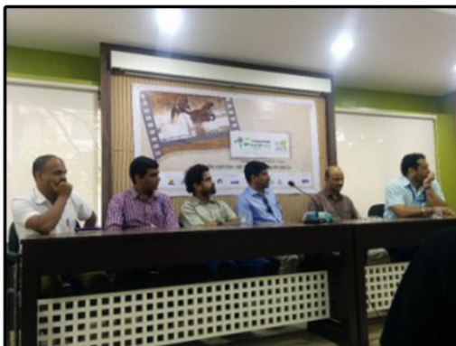
Panel discussion on Eco Journalism