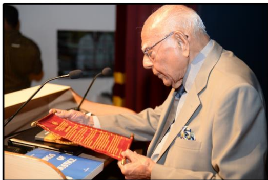
Adv. Ram Jethmalani delivering Law Day oath to students