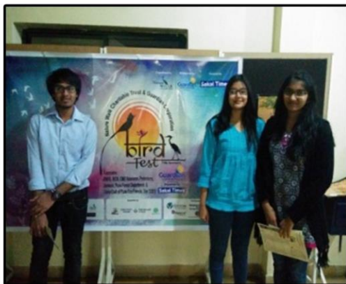
ECOCON cell students