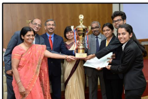
Dignitaries & RMNLU Lucknow team with Glittering Trophy