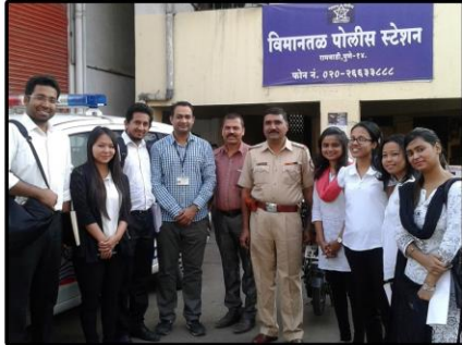
Students at Viman Nagar Police Station as part of study visit