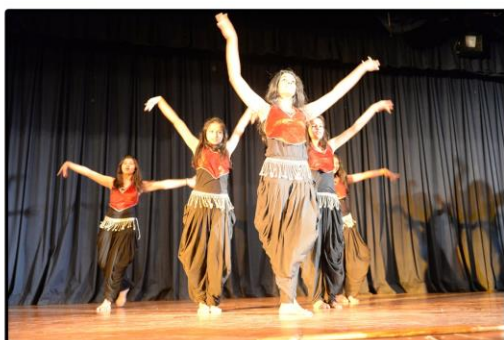
Group Dance Competitions

Second day witnessed twenty-one events in the Campus including Hindi solo singing, solo dance, fashion show photography, MUN, creative writing, quizzes, group dance and parliamentary debate.