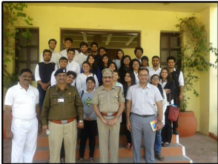
Students at Open Air Prison, Yerwada as part of study visit